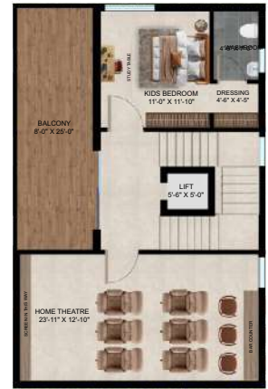
SECOND FLOOR PLAN SLAB AREA : 791.5 sq.ft