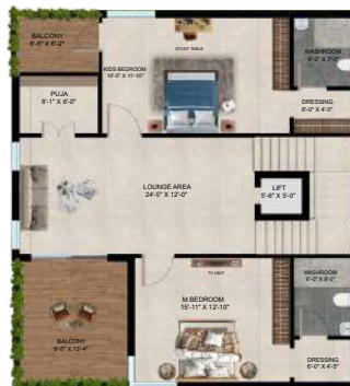
FIRST FLOOR PLAN SLAB AREA : 1,396.7 sq.ft