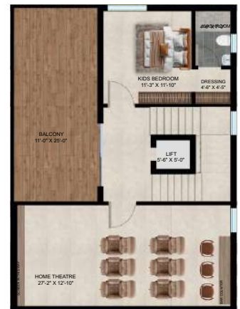
SECOND FLOOR PLAN SLAB AREA : 843.0 sq.ft