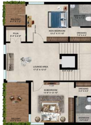
FIRST FLOOR PLAN SLAB AREA : 1,118.1 sq.ft