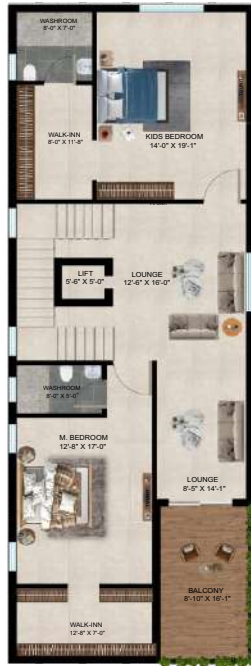
FIRST FLOOR PLAN SLAB AREA : 1,544.8 sq.ft