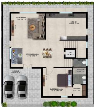
GROUND FLOOR PLAN SLAB AREA : 1,396.7 sq.ft