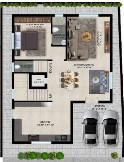
GROUND FLOOR PLAN SLAB AREA : 1,186.2 sq.ft TOTAL SLAB AREA : 3,287.3 sq.ft