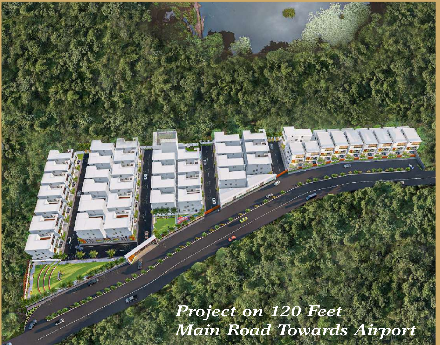
"Aerial Layout View"