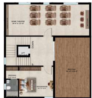
SECOND FLOOR PLAN SLAB AREA : 1041.2 sq.ft