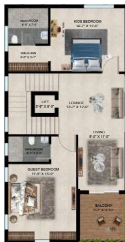
FIRST FLOOR PLAN SLAB AREA : 1157.5 sq.ft