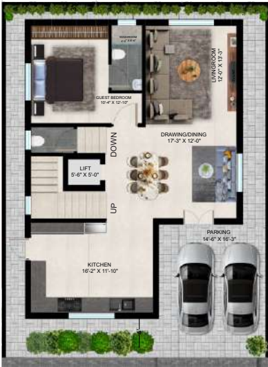
GROUND FLOOR PLAN SLAB AREA : 1,117.5 sq.ft TOTAL SLAB AREA : 3,081.6 sq.ft