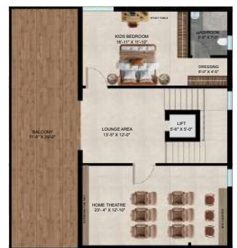
SECOND FLOOR PLAN SLAB AREA : 967.8 sq.ft