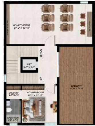
SECOND FLOOR PLAN SLAB AREA : 846.6 sq.ft