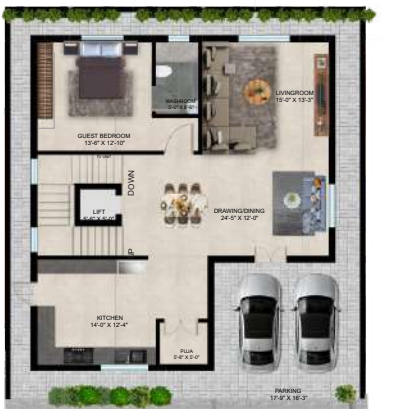
GROUND FLOOR PLAN SLAB AREA : 1,413.9 sq.ft TOTAL SLAB AREA : 3,874.4 sq.ft