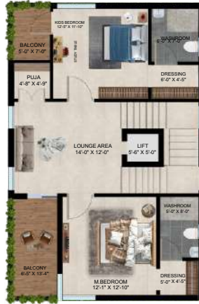
FIRST FLOOR PLAN SLAB AREA : 991.3 sq.ft