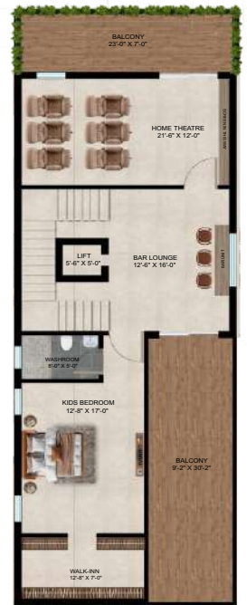
SECOND FLOOR PLAN SLAB AREA : 1105.4 sq.ft