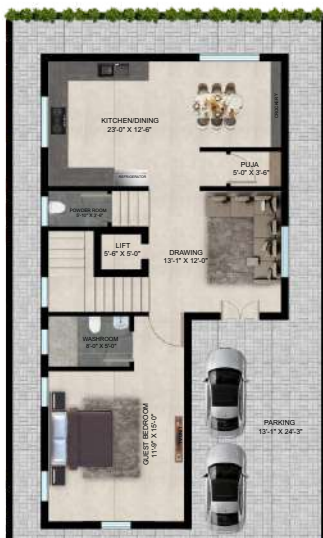
GROUND FLOOR PLAN SLAB AREA : 1157.5 sq.ft