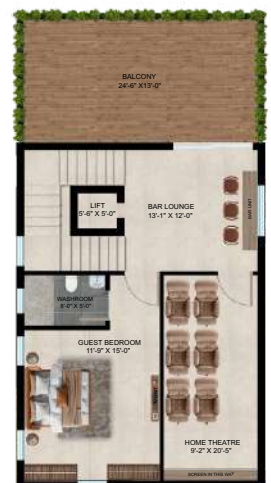
SECOND FLOOR PLAN SLAB AREA : 1157.5 sq.ft