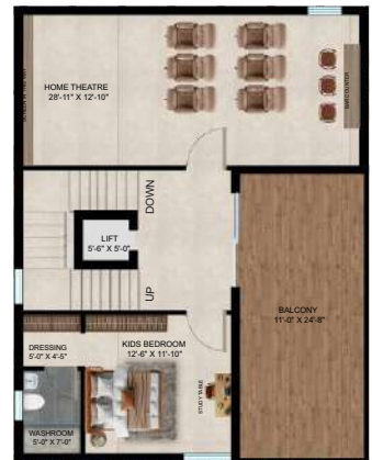
SECOND FLOOR PLAN SLAB AREA : 914.9 sq.ft