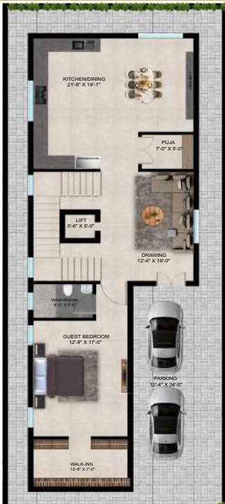
GROUND FLOOR PLAN SLAB AREA : 1,544.8 sq.ft