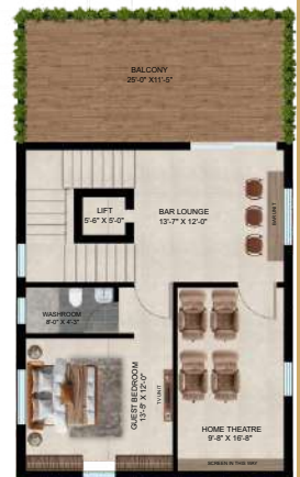
SECOND FLOOR PLAN SLAB AREA : 764.5 sq.ft