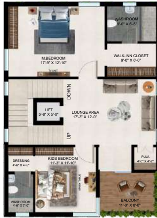
FIRST FLOOR PLAN SLAB AREA : 1,117.5 sq.ft