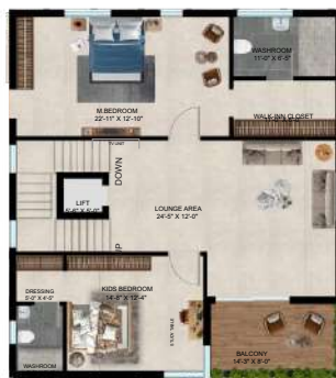
FIRST FLOOR PLAN SLAB AREA : 1,413.9 sq.ft