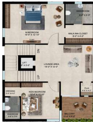
FIRST FLOOR PLAN SLAB AREA : 1,186.2 sq.ft