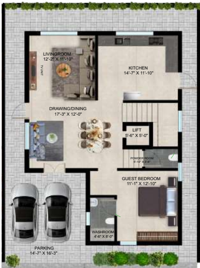
GROUND FLOOR PLAN SLAB AREA : 1,118.1sq.ft