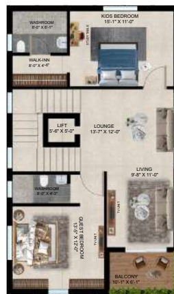
FIRST FLOOR PLAN SLAB AREA : 1049.5 sq.ft