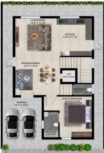
GROUND FLOOR PLAN SLAB AREA : 991.3 sq.ft