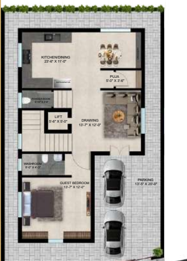
GROUND FLOOR PLAN SLAB AREA : 1049.9 sq.ft